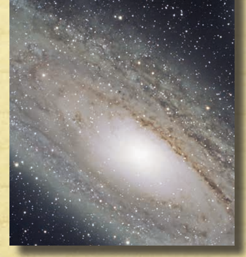
It is impossible to do this in space. What is it?